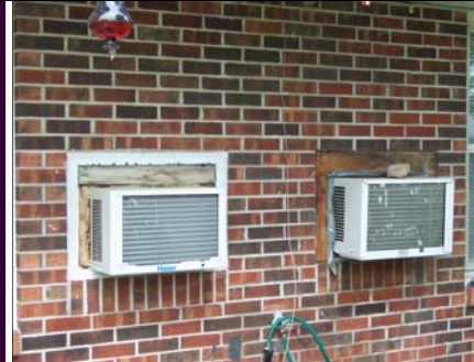
Before (left) and after (right) photos of window and other structural improvements at Moniteau County Senior Housing, made possible by funds from Community Development Block Grant (CDBG).

Recently completed CDBG projects include street improvements for the City of Boonville Industrial Park, housing rehabilitation for the Moniteau County Senior Housing in California and Pilot Grove Senior Housing, and improved ADA accessibility in the Cole County courthouse.