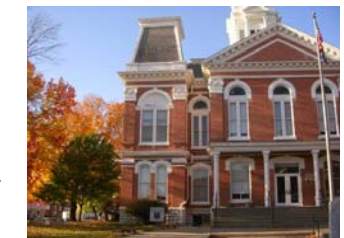
Howard County Courthouse

Howard County was awarded $9,500.00 to have a historic structure report completed for the Howard County Courthouse located in Fayette, Missouri. The structural report is needed in order to prioritize repair and rehabilitation projects for the building. The building has been settling through time causing deterioration to the interior and exterior of the courthouse.