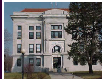
Cooper County Courthouse

This is the second round of funding that has been made through this program. The funding is currently available to Courthouses that are listed on the National Register of Historic Places. The funding can also be used for the preparation of a National Register Nomination, placing a courthouse on the National Register.